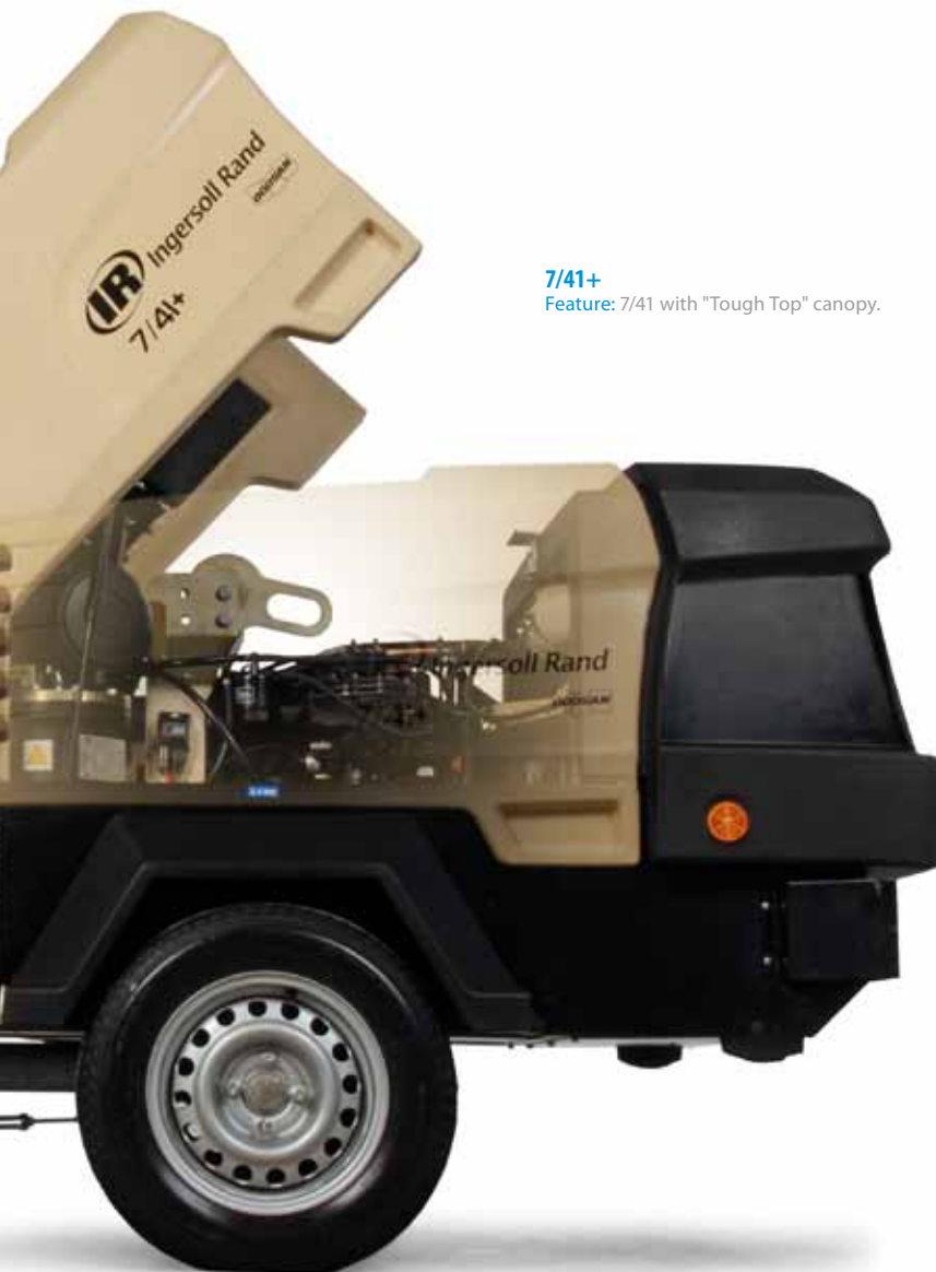
7/41+ Feature: 7/41 with "Tough Top" canopy.

Serviceability is excellent, with easy access to all maintenance points . All areas have been carefully designed for ease of inspection, maintenance and repair. Service intervals for different compressor components have been rationalized to reduce associated costs for the customer and increase utilization in the plant hire industry.